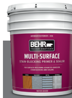
BEHR® MULTI-SURFACE PRIMER & SEALER NO. 436

An interior/exterior water-based primer that is excellent for stain-blocking and adhesion over multiple substrates.