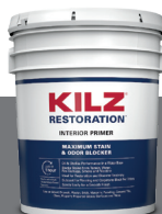
KILZ RESTORATION® PRIMER NO. L2002

Meets the most stringent VOC regulations nationwide