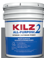
KILZ 2® ALL-PURPOSE PRIMER NO. 2000

Protects metal substrates against rust and corrosion