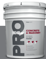
BEHR PRO® CONCRETE & MASONRY PRIMER NO. PR060

An interior/exterior water-based primer for use on concrete, stucco, fiber cement, brick, plaster and other above-grade masonry surfaces.