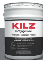
KILZ® ORIGINAL INTERIOR/EXTERIOR NO. 1008 (MAX VOC 450 G/L) NO. 1009 (MAX VOC 350 G/L)

An interior/exterior oil-based primer that offers powerful stain-blocking and wood penetration.