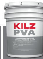
KILZ® PVA DRYWALL PRIMER NO. PX010

An interior water-based primer that helps achieve a more uniform, professional quality finish on new drywall.