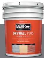
BEHR® DRYWALL PLUS PRIMER & SEALER NO. 73

Designed For Use On A Wide Variety Of Substrates.