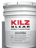
KILZ KLEAR® PRIMER NO. L2201

Can be used to block odors from subfloor when replacing carpet or wood flooring