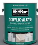
BEHR® ACRYLIC-ALKYD ENAMEL UNDERCOATER NO. 437

An interior/exterior water-based primer formulated to provide a sealed and sandable surface for BEHR PREMIUM® Urethane Alkyd Enamels and other BEHR premium topcoats.