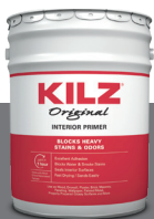
KILZ® ORIGINAL INTERIOR NO. 1000 (MAX VOC 450 G/L) NO. 1003 (MAX VOC 350 G/L)

Provides Superior Stain-Blocking, Sandability And Application Performance.