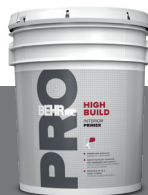
BEHR PRO® HIGH BUILD PRIMER NO. PR040

Topcoat can be applied in as little as one hour**