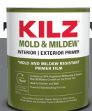
KILZ® MOLD & MILDEW PRIMER NO. L2046

Great for schools, hospitals, and retail offices