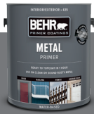
BEHR® METAL PRIMER NO. 435

Designed For Use On Specific Substrates.