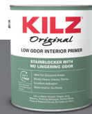
KILZ® ORIGINAL LOW ODOR INTERIOR NO. 1004 (MAX VOC 350 G/L)

Durable primer film is designed for use in both interior and exterior projects