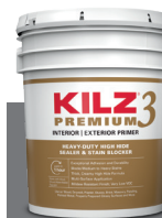
KILZ 3® PREMIUM PRIMER NO. 1300

Hides previous colors, scuffs, marks and light stains