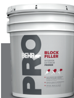
BEHR PRO® BLOCK FILLER NO. PR050

Great for schools, hospitals, and retail offices