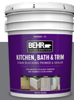
BEHR® KITCHEN, BATH & TRIM PRIMER & SEALER NO. 75

Topcoat can be applied in as little as one hour