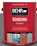
BEHR® BONDING PRIMER NO. 432

Designed To Address Unique Project Challenges Not Offered By Conventional Primers.