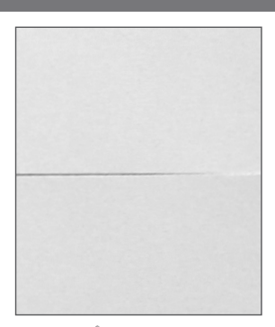
BEHR PRO® Pre-Catalyzed Waterborne Epoxy Semi-Gloss